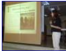
Tips on talking to members of the community will be a part of the learning tract.

Campers are expected to leave ALIVE by the James with a plan for sharing what they have learned with others in their home communities. Throughout the week, campers will take field notes and make journal entries. These field journals will serve as a personal reminder of the camper's experiences. Additionally, campers will work as individuals or in small groups to create a plan of action for sharing their experiences with others (i.e. speaking to a class at school or to their board of supervisors, writing an article for the paper, etc.)