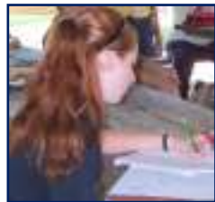
Campers will be encouraged to keep field notes of learning tract activities.

Youth will be immersed in studies of environmental education specifically related to the James River Watershed as part of the Chesapeake Bay Watershed. Additionally, campers will learn more about Virginia's state parks in hopes that they will develop an enjoyment, appreciation and better understanding of Virginia's great outdoors.