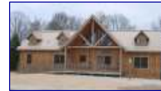
Campers will stay in modern cabins at James River State Park.

During the week, campers will work cooperatively with their cabin mates to prepare group meals and keep the park facilities clean.